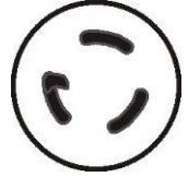
Nema L6-30 Twist